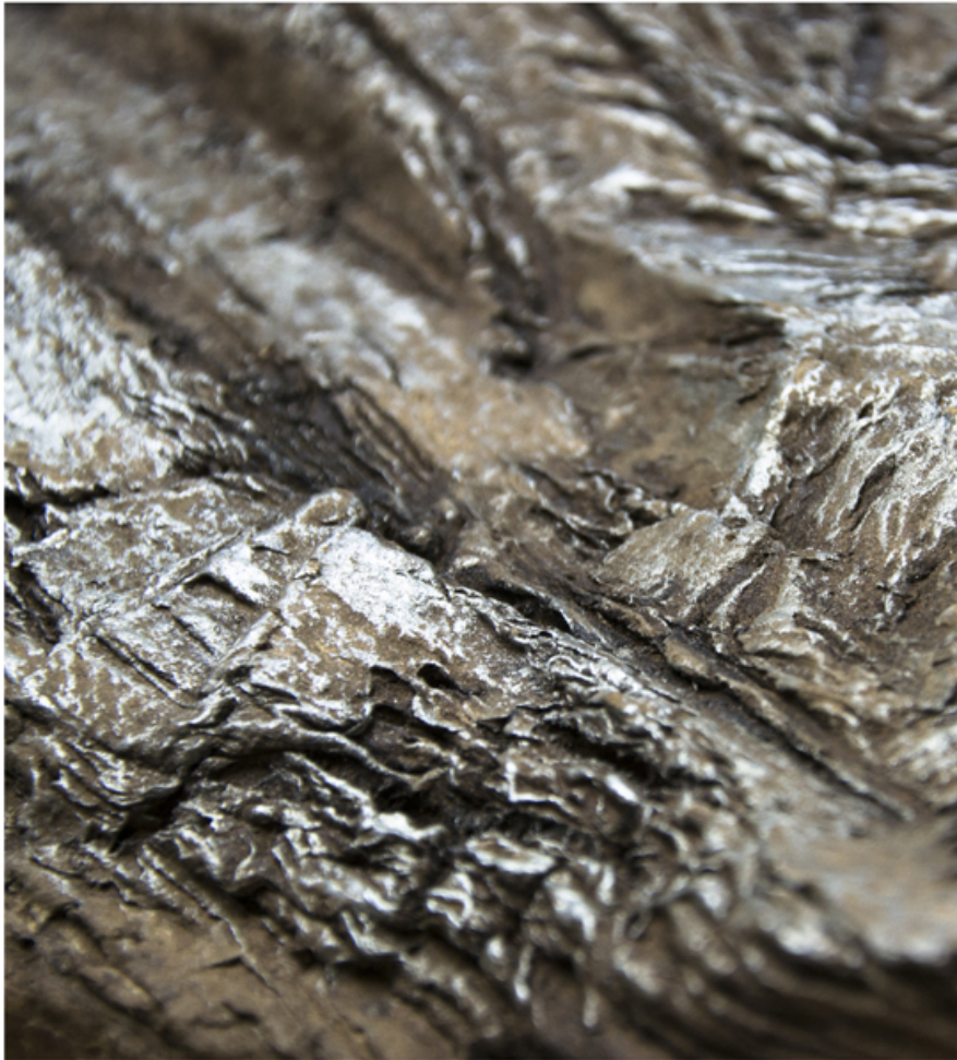
Errances Terrestres texture sample